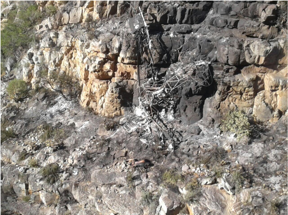
Figure 1. The wreckage destroyed by fire

was flying the helicopter strong wind conditions prevailed in the area during their operation.